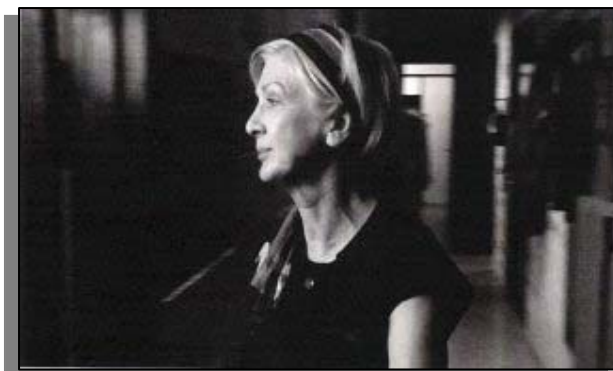
Midge on set in the film "Widow"