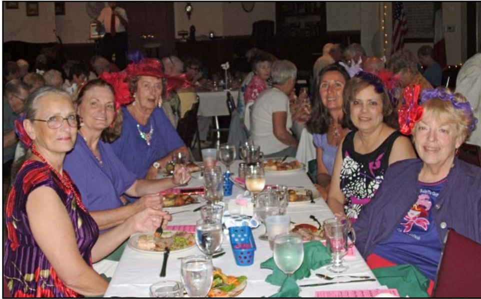
The Striking Red Hatters of Valrico

Where would Early Bird Dinner Theatre be without the frequent visits of the Red Hat Ladies?