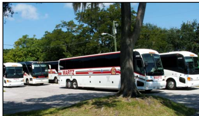
Buses lined up in the Early Bird Parking Lot

The very first theatre on his list was the Early Bird Dinner Theatre!